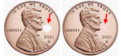
Fentanyl Lethal Dose

Fentanyl is an opioid pain medication 50-100 times stronger than morphine. Carfentanil is even more